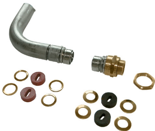
Heat cable protection kit